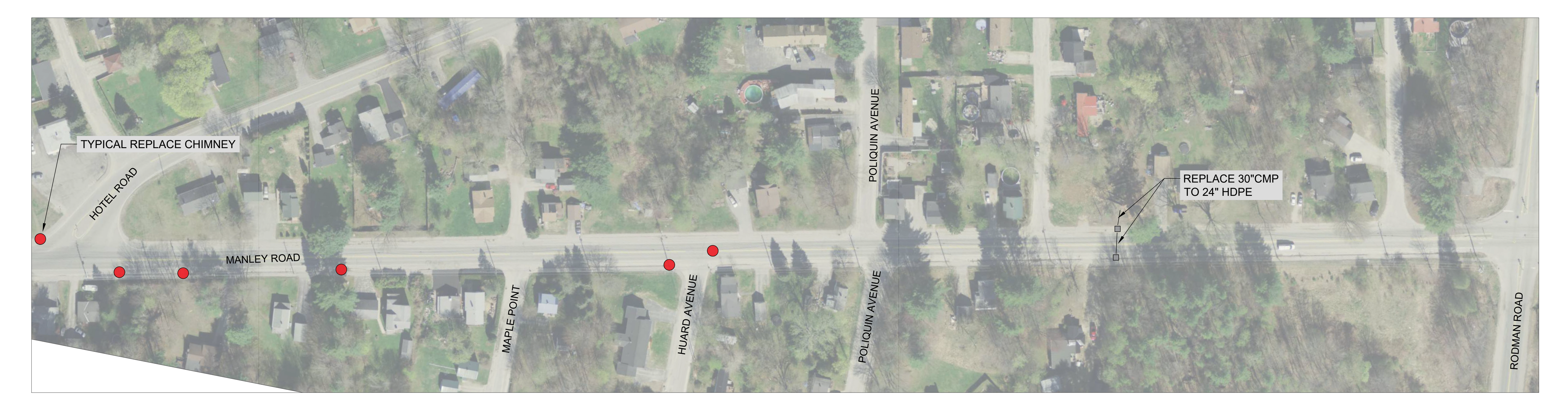
HOTEL ROAD PAVEMENT RESTORATION PROJECT